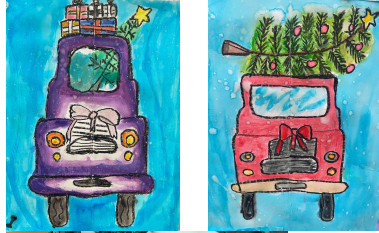
Grade 6 student Watercolour paintings by Tiger M & Alli N